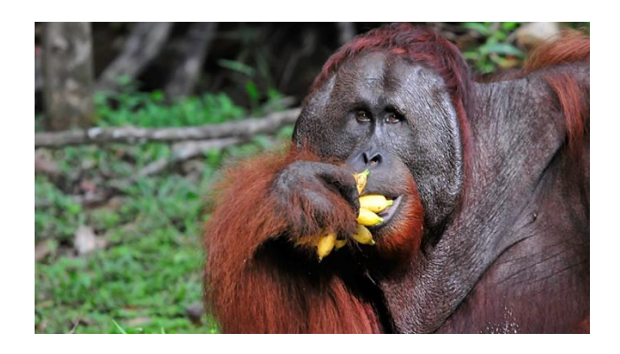
Day 7: Fly Mulu – Kota Kinabalu (55 min)

We take the morning flight to Kota Kinabalu. Depending on what time we fly out of Mulu there may be some time to walk along self-guided trails or at the visitor's centre. Kota Kinabalu known as KK to the locals, the capital of Sabah is a now a modern multicultural city. The evening is free to relax, explore the bustling Filipino markets or enjoy a sundowner on the waterfront.