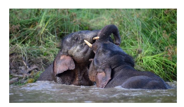
Day 12: In Sakau

Please make sure that you travel light to Sukau Rainforest Lodge. There will be a complimentary Night Cruise if no sightings of the Proboscis Monkey on the FIRST Afternoon Cruise.