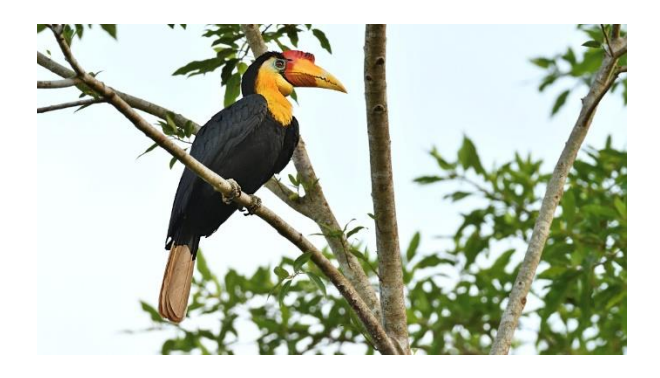
Day 8: Day at leisure

Free day; optional snorkeling and island trip, wetland birdwatching or cultural village